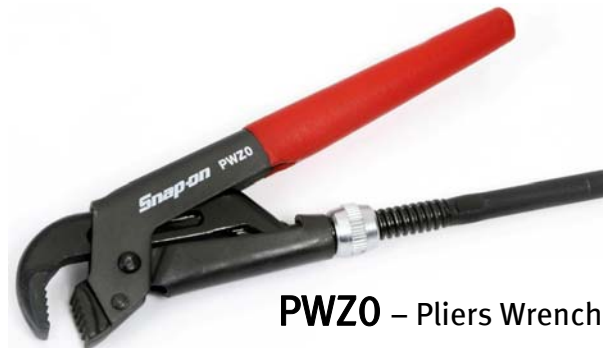
PWZ0 – Pliers Wrench