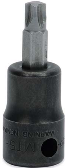
PFMTS1E – 3/8" Square Drive MTS-1 Mortorq® Super Bit Socket (use with Air Ratchet or Hand Ratchet)