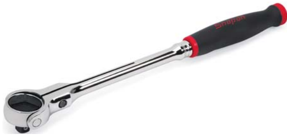
FHNF100 – 3/8" Drive Swivel, Round Head Ratchet